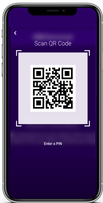
Scan the code on TV.

No more clumsy password entries with the remote