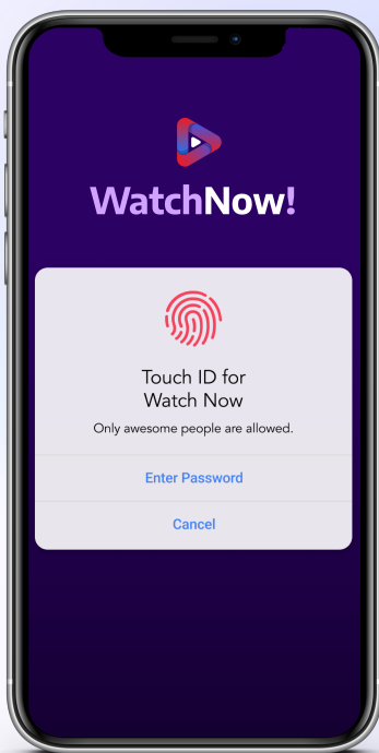
Log in with fingerprint.